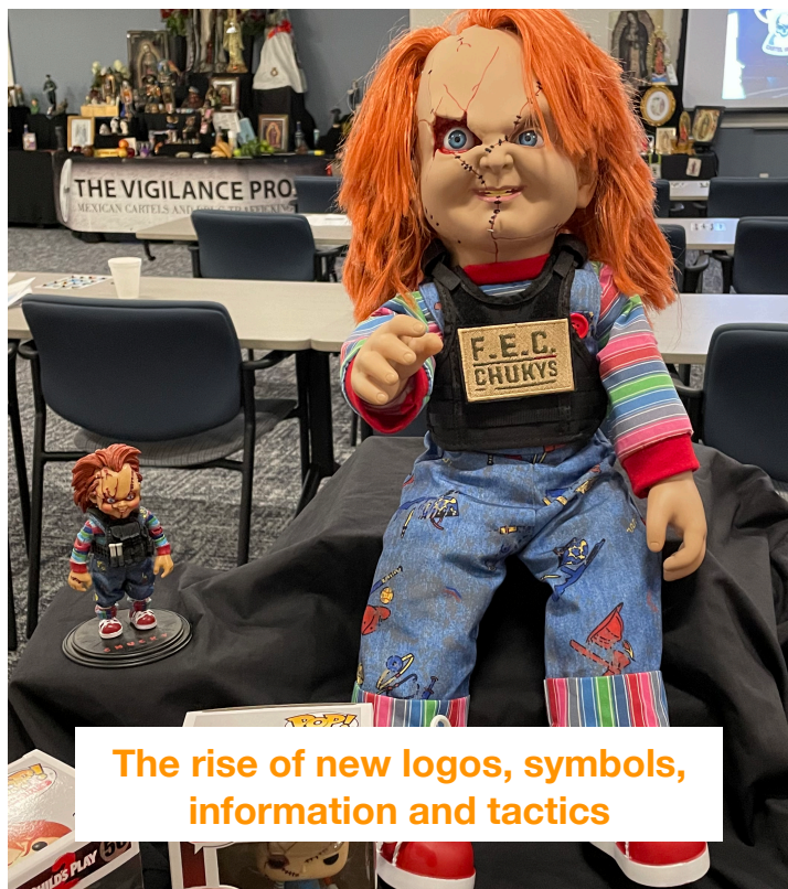
The rise of new logos, symbols, information and tactics