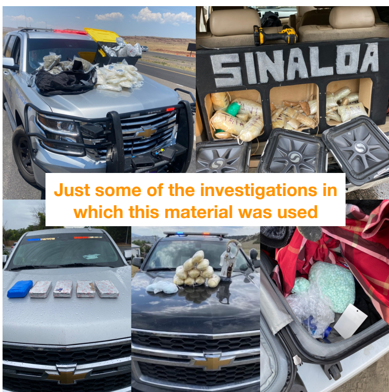
Just some of the investigations in which this material was used

Our course is constantly being updated with relevant information.