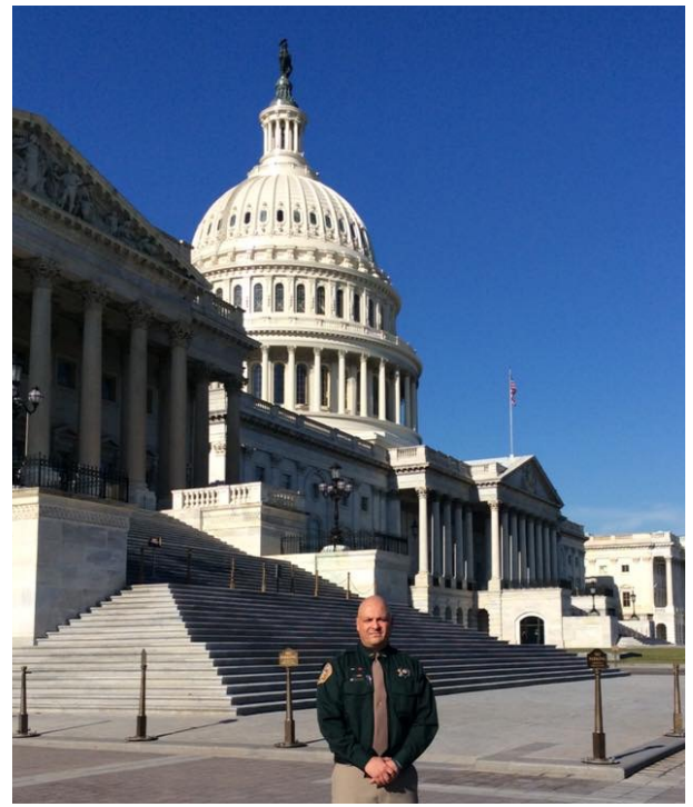
United States Congress Washington D.C.