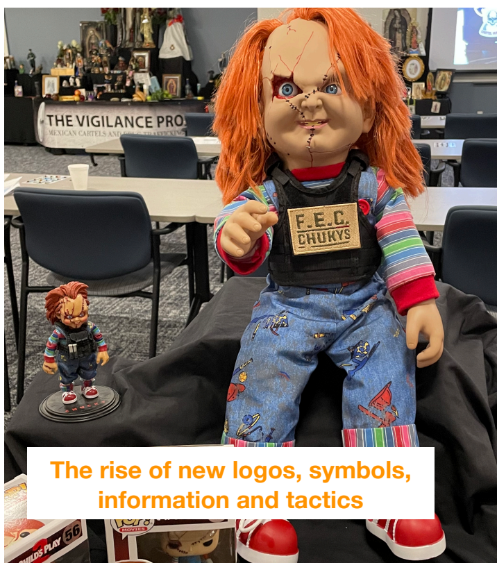
The rise of new logos, symbols, information and tactics