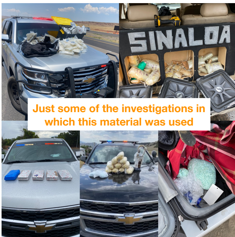
Just some of the investigations in which this material was used