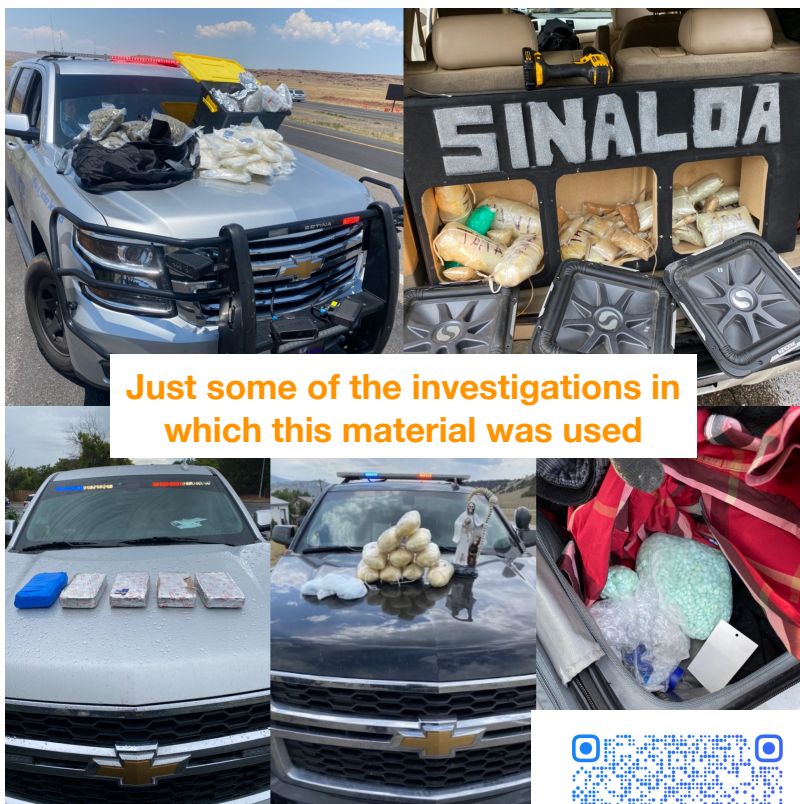
Just some of the investigations in which this material was used

For more reviews check out our 99% recommended rating at leo-network.com