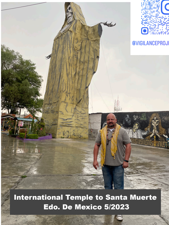
International Temple to Santa Muerte Edo. De Mexico 5/2023