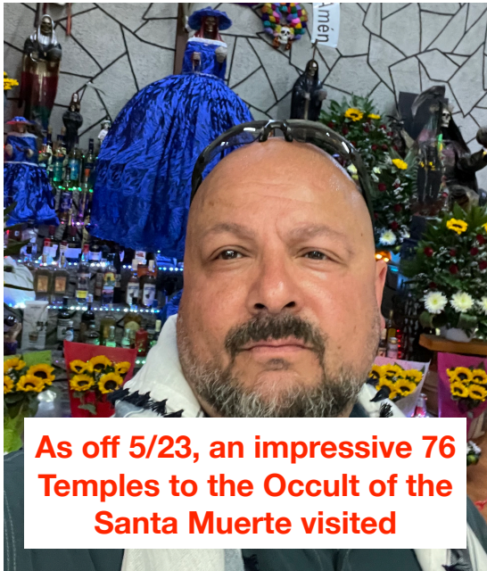
As of 5/23, an impressive 76 Temples to the Occult of the Santa Muerte visited