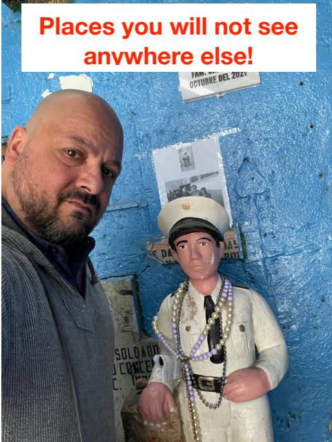
Places you will not see anywhere else!