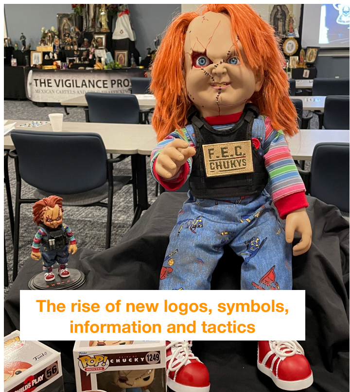
The rise of new logos, symbols, information and tactics