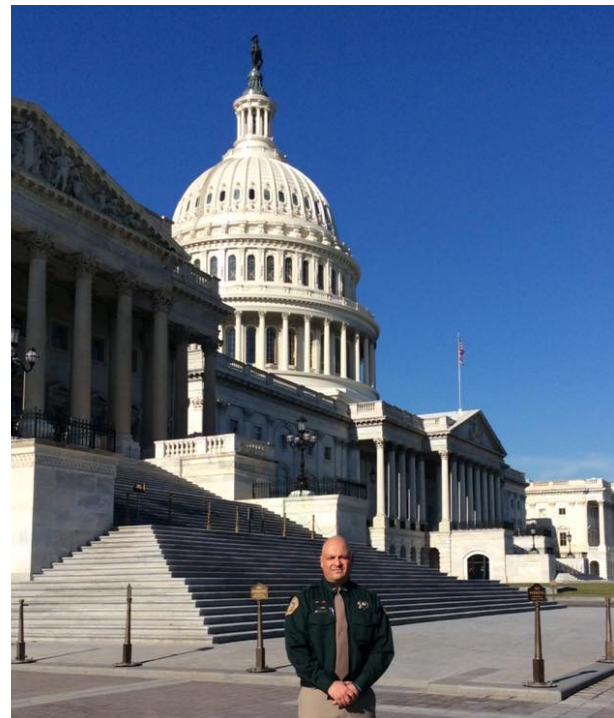
United States Congress Washington D.C.