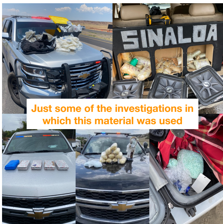
Just some of the investigations in which this material was used