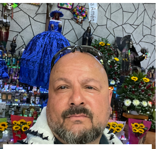
As off 5/23, an impressive 76 Temples to the Occult of the Santa Muerte visited

<u>This 4 day course by subject matter expert Victor Galarza. Learn from</u> <u>an active highly successful decorated investigator</u> <u>www.thevigilanceproject.net</u>